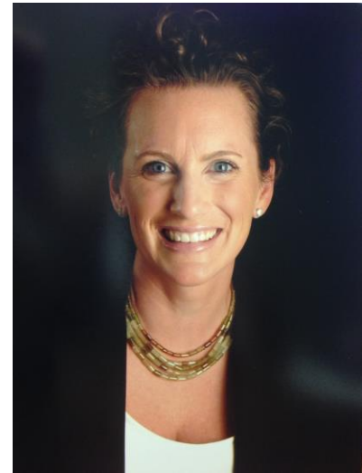
Eleanor Estes Badgley Mischka Tech Providers