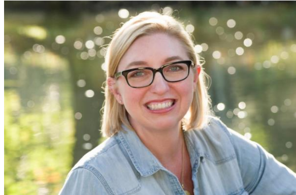
Audrey Atkins Vivienne Westwood