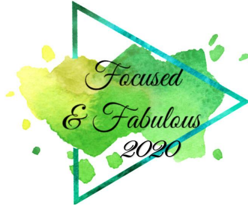
Table Captain Gallery

It takes a special person to share talent and sacrifice time away from their family and friends to host an event table. This year we have been blessed with an amazing cadre of individuals!! Their commitment to saving the lives of critically at-risk youth has made Focused and Fabulous 2020 a success. Please take notice of their beautiful visages in our Table Captain Gallery.