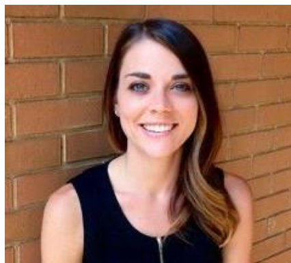
Gowey Goodin & Co. Trina Turk