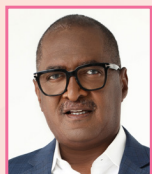
PINK FROG LEGACY AWARD RECIPIENT Mathew Knowles Breast Cancer Survivor and Advocate